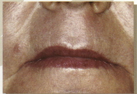
19 days after UniPulse laser treatment