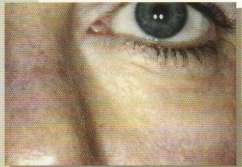
19 days after UniPulse laser treatment